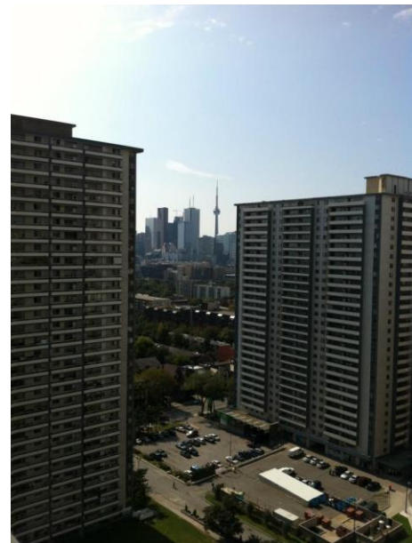
The view of downtown Toronto from the VA3XPR site

to IRLP and Echolink for global communications. All uses of the repeater that support the above objectives are most welcome and strongly encouraged.