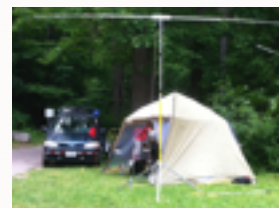
A typical setup for field day

This annual event is held on the fourth weekend in June. Members test abilities to set-up in an emergency situation. We operate for 24 hours to make as many contacts as possible. The BBQ potluck is an opportunity for members to bring their family and friends to experience amateur radio during this event.