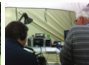
Making contacts on field day