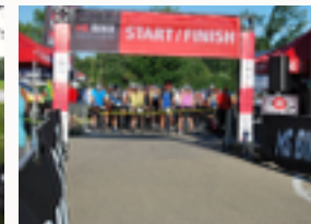
MS-Bike tour relies on Hams to assist with organizing.