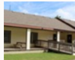
Operating at the Secrets of Radar Museum

http://k8cj.com/index.php/historic-bridge-weekend/