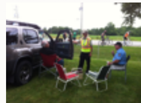
Providing communications at a checkpoint

The London Amateur Radio Club has a longstanding relationship with those who run the MS Bike tour in the London region. We provide communication resources at checkpoints and along the route. This is an opportunity to work an "Active Net", using a number of technologies such as APRS, 2 Meter phone and repeater services.