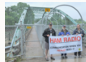
Historical Bridges Event at the Black Friar's Bridge