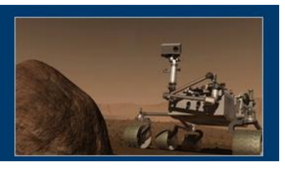
Artist Concept of the Mars Science Laboratory Rover

There may not be any ham radio station on the planet Mars, but there may soon be a lot of ham radio callsigns making their way across the surface of the red planet.