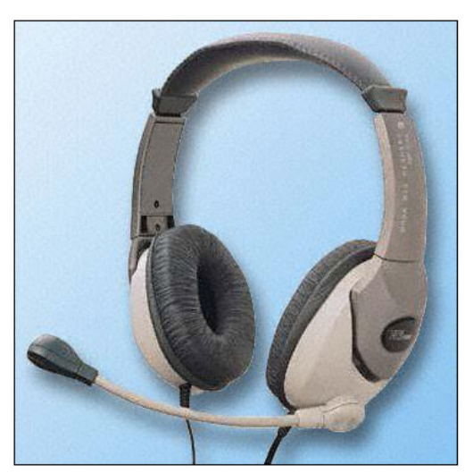
Typical computer headset - less than $30

The headset pictured above is the Heil headset manufactured specifically for radio use. It can be purchased at most ham radio outlets for about $300.