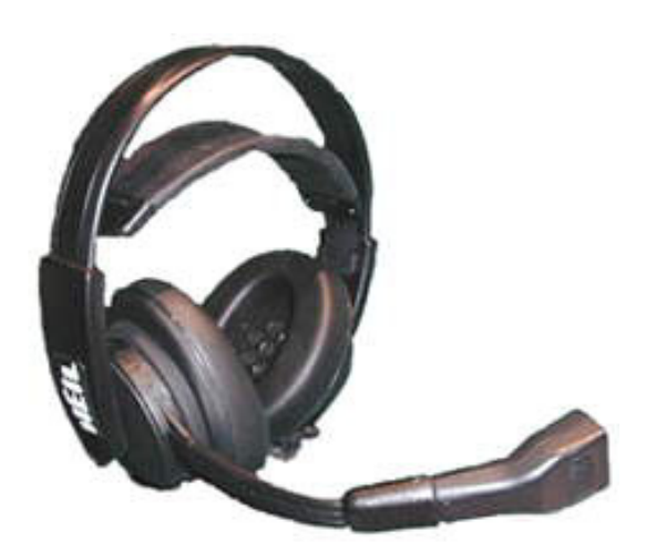
Heil headset for ham radio $300

During the January presentation, I talked about buying an inexpensive computer headset and rewiring the microphone for ham radio use. With field-day quickly approaching, this is a quick and easy project that will add to the enjoyment of the event.