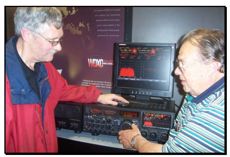
I'll take 2 please!

All of the usual vendors were there selling their wares. Below is a typical scene of some fine gentlemen making some suggestions to their love-ones for possible Father's Day gifts: